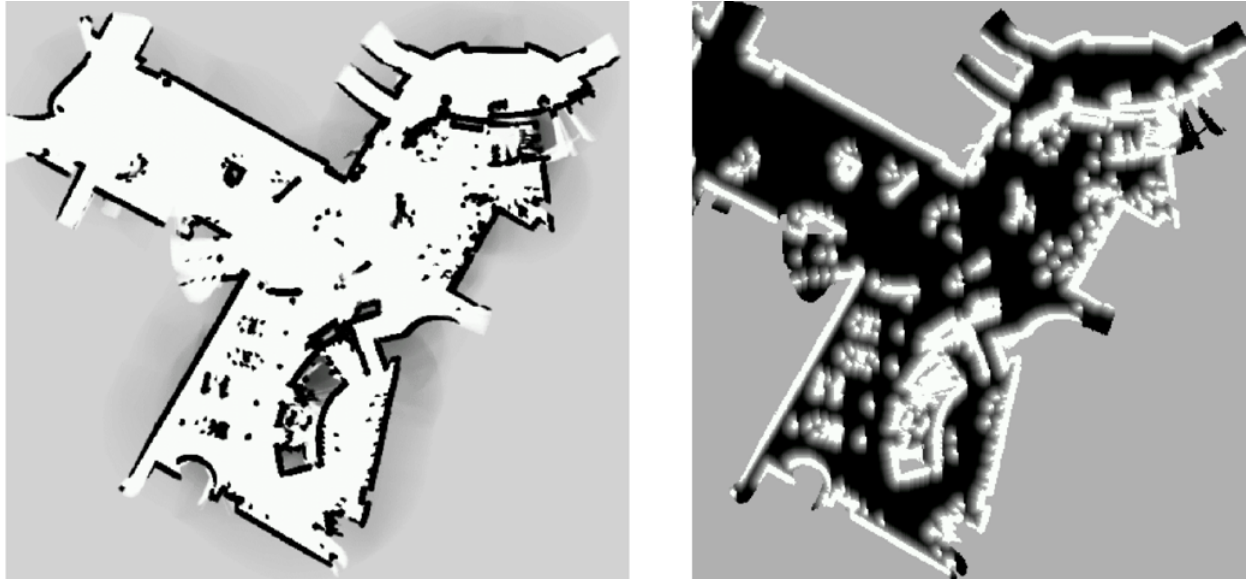
Figure 3: A metric map and the respective likelihood field (or distance matrix).

poses (i.e., locations and orientations) in the map. Then, the particle filter repeats the following steps: